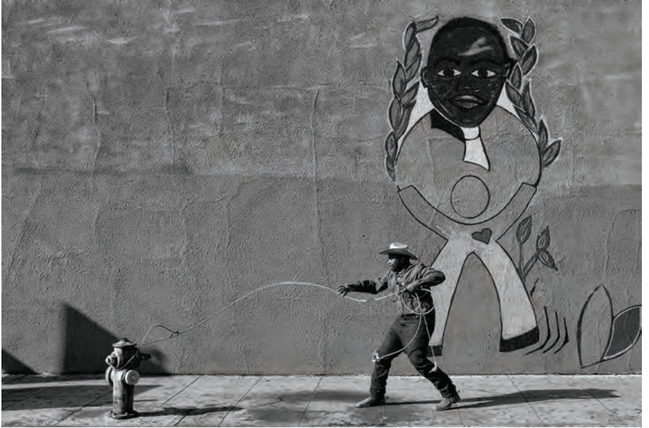
A Compton cowboy practices his roping prior to participating in the MLK parade in Los Angeles, January 16, 2017