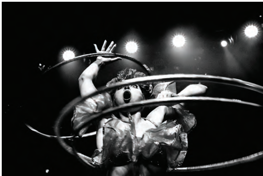
Caught In The Act, 2017