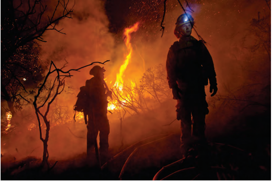
California Fire Firefighters wait for more water as they battle a large wildfire threatening homes in the Coronado Hills neighborhood of San Marcos, 2014.