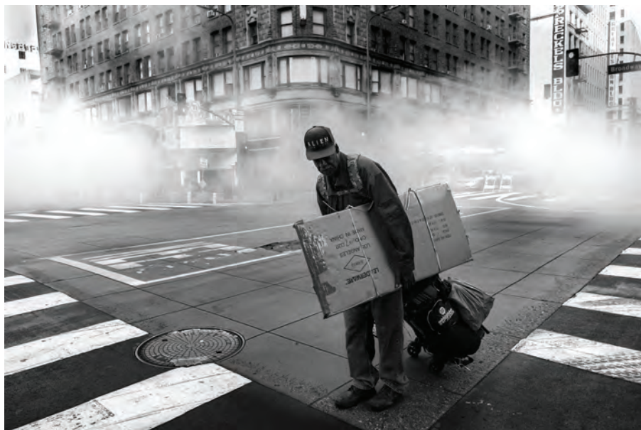
A man walks across the street in downtown Los Angeles during the filming of a Cadillac commercial where fog was being used, 2018