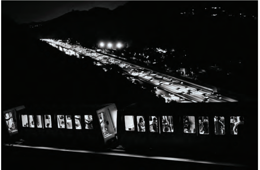
Homeward Bound, 2022