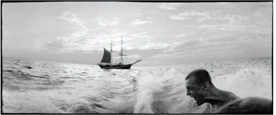
Ethan Embry and the Albatross, White Squall, 1996