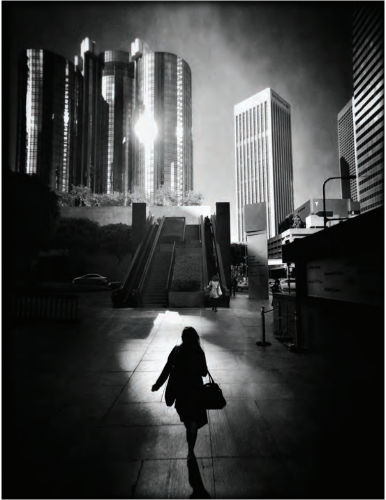
Last Light of Day, 2016