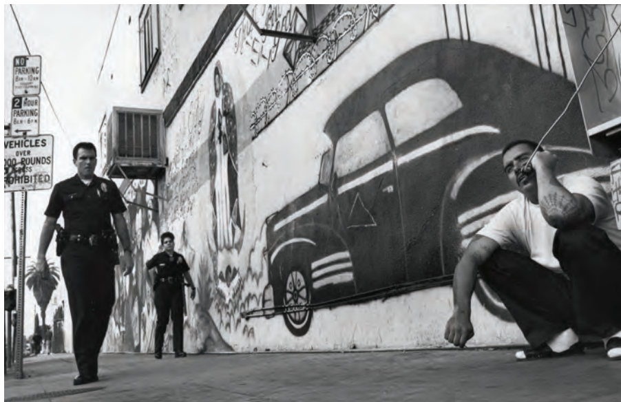
Police approach Spider while he talks on a payphone, 1992