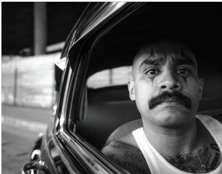
Rascal In The '47, 2019